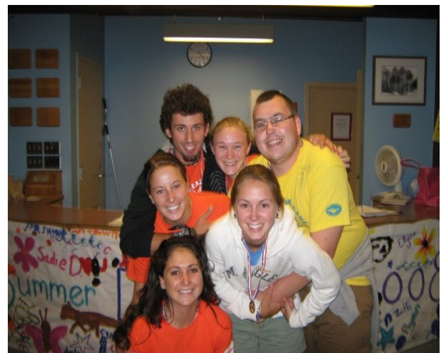
2008 Summer Daze Camp Counselors